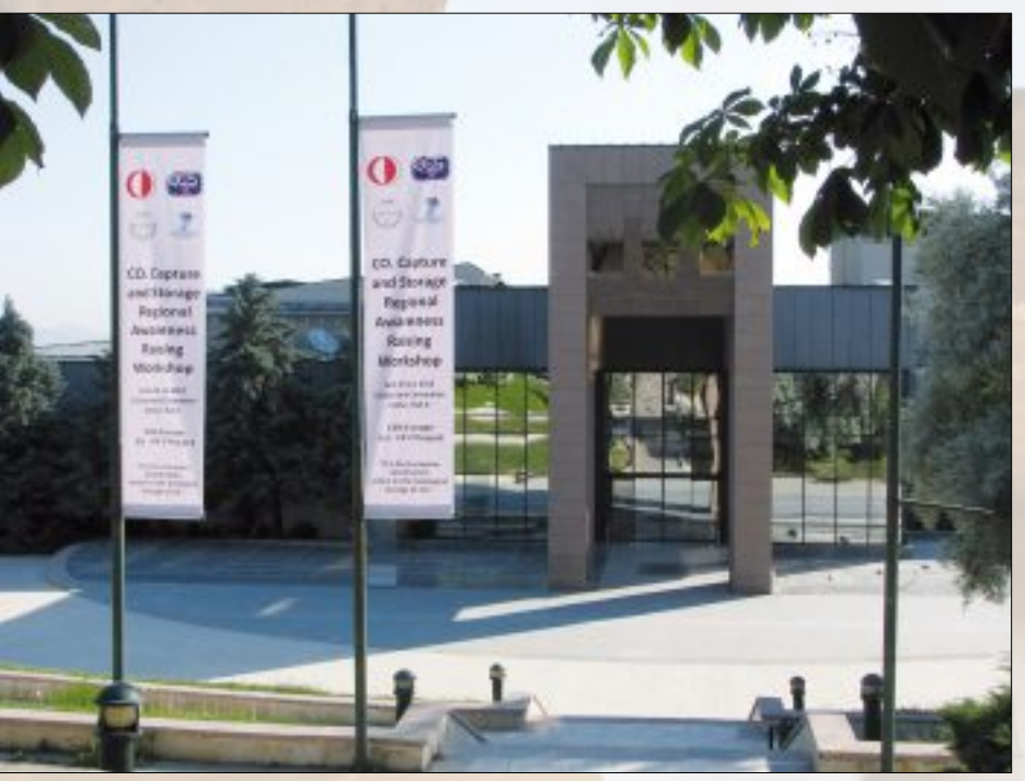
Fig. 3 Culture and Convention Center of the Middle East Technical University in Ankara – venue of the 2<sup>nd</sup> CGS Europe CCS awareness-raising workshop.

CCS awareness-raising workshops represent a completely different kind of activity. They focus on all kind of CCS stakeholders in "follower" countries, i.e. countries with limited CCS activity so far. The tradition of these workshops dates back to 2007 when the first awarenessrising workshop was organized in Zagreb, Croatia. Since then, three more workshops took place in Slovakia, Lithuania and Turkey, each significantly increasing the level of general awareness of and knowledge about the CCS technology in a particular region of Europe. The workshops usually start with an explanation about the role of CCS in the decarbonisation portfolio and climate change mitigation, followed by presentation of the principles of CCS and description of the current status of the technology and its deployment in Europe and worldwide. Country/region specific topics are usually discussed after that, including the local potential of implementation of the technology, suitable examples from abroad and more technology-specific subjects. As a result, workshop participants (embracing usually a broad spectrum of stakeholders from policy makers and regulators, through industry representatives and consultants, up to researchers and students) are provided with a comprehensive overview of the CCS technology, its current status and future expectations.