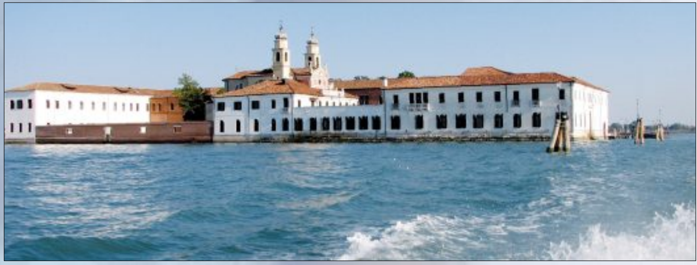
Fig. 6 San Servolo island in Venice - venue of the 8th CO,GeoNet Open Forum held on 9-11 April 2013 (www.co2geonet.com).

This will be achieved by expanding the membership of the CO<sub>3</sub>GeoNet Association to the interested research institutions who are active in CGSrelated research. This process will start in 2013, changing CO<sub>3</sub>GeoNet currently comprising 13 members from 7 countries - into a really pan-European scientific body and strengthening its unique multidisciplinary expertise.