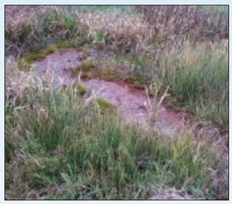
Fig. 2 Natural CO, seep near Laacher See, Germany.

provide an excellent opportunity to test various monitoring methods that have to be effective at different storage sites in future. All of these aspects related to the ongoing and planned research of natural \mathrm{CO_2} laboratories were discussed at the above-mentioned workshop, contributing to spreading of the relevant knowledge throughout Europe.